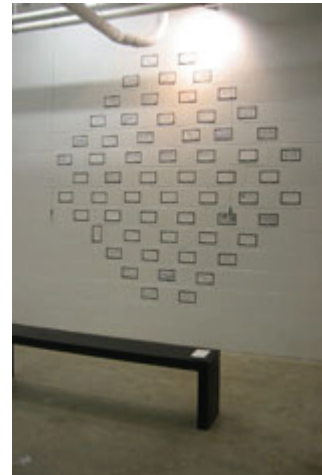
One of the central pieces of the “Guns, Youth & Architecture” exhibit is its interactive “idea wall,” made up of cards with text prompting visitors to “Think about it, leave a thought, ask a question, design a solution.” The students who designed the exhibit filled in half of the cards in advance, leaving the rest for inspired visitors.